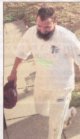
Former Pakistan ace Saqlain Mushtaq heads back to the dressing room